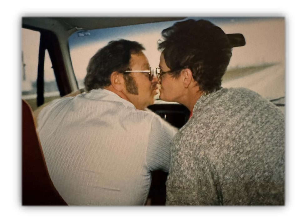
We begin to remember not just that you died, but that you lived. And that your life gave us memories too beautiful to forget.