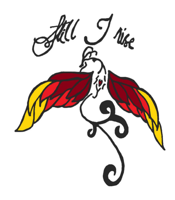
I Will Rise Again